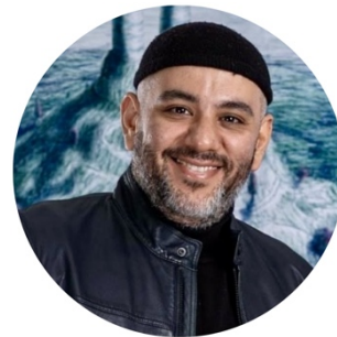
Abbas Taheri for his project DWELLERS OF THE SEA